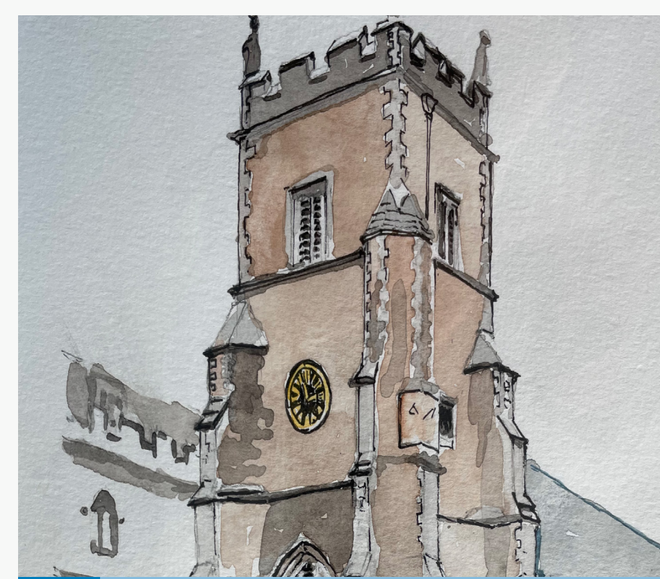
7 St Botolph's Church