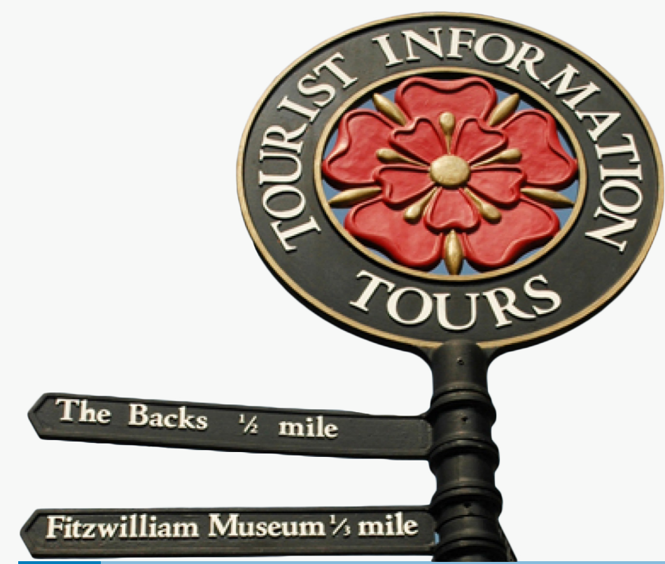
1 START: Peas Hill

A walk through 800 years of plagues, pandemics and pestilence