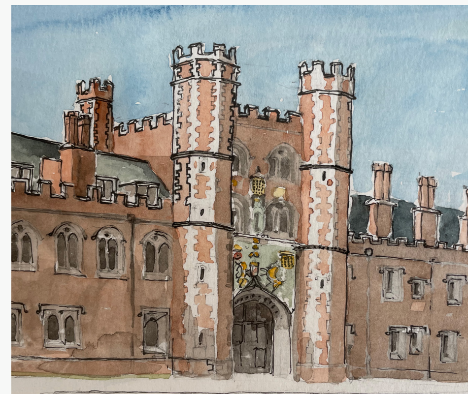
3 St John's College