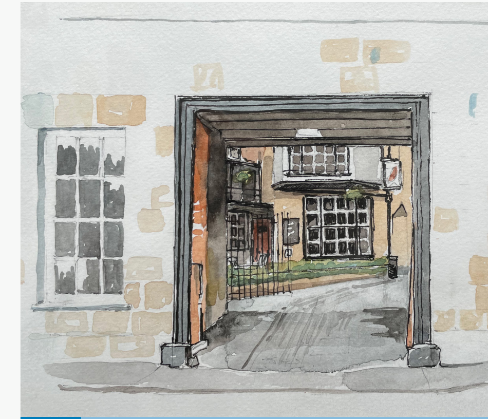
16 The Eagle