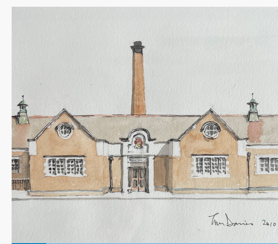
13 Bath House