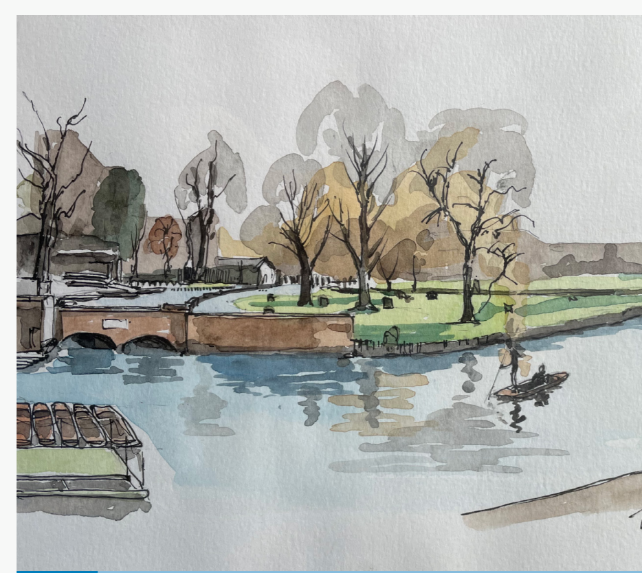
8 Laundress Green