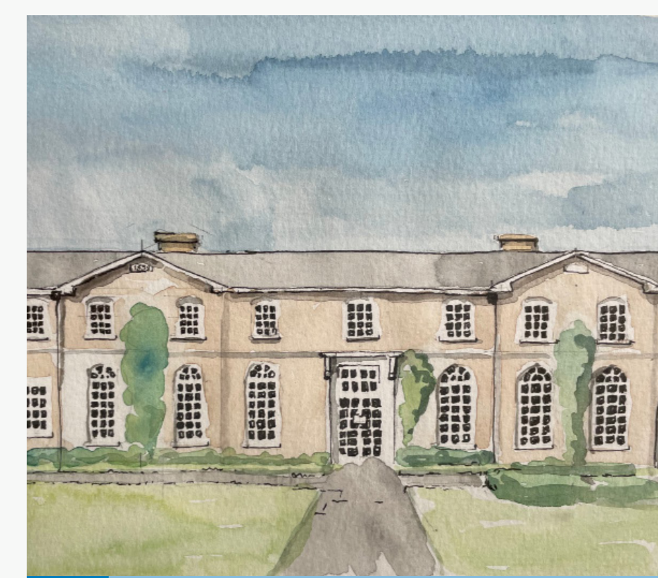
12 Ditchburn Place