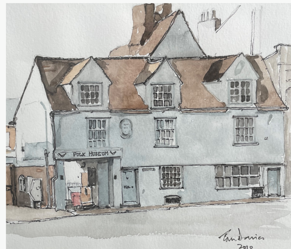
4 Cambridge (Folk) Museum