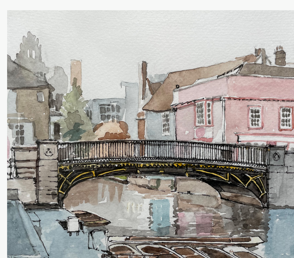
5 Magdelene Bridge