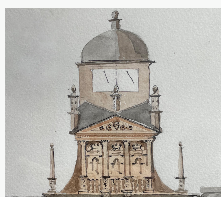
6 Gate of Honour