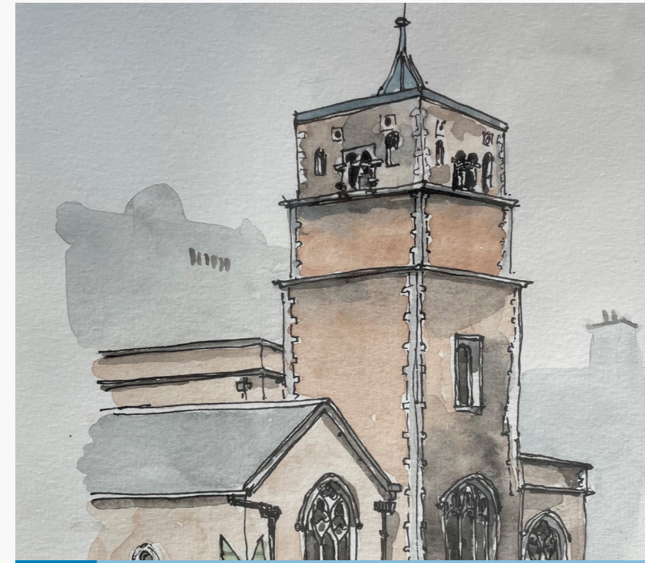
2 St Benet's Church