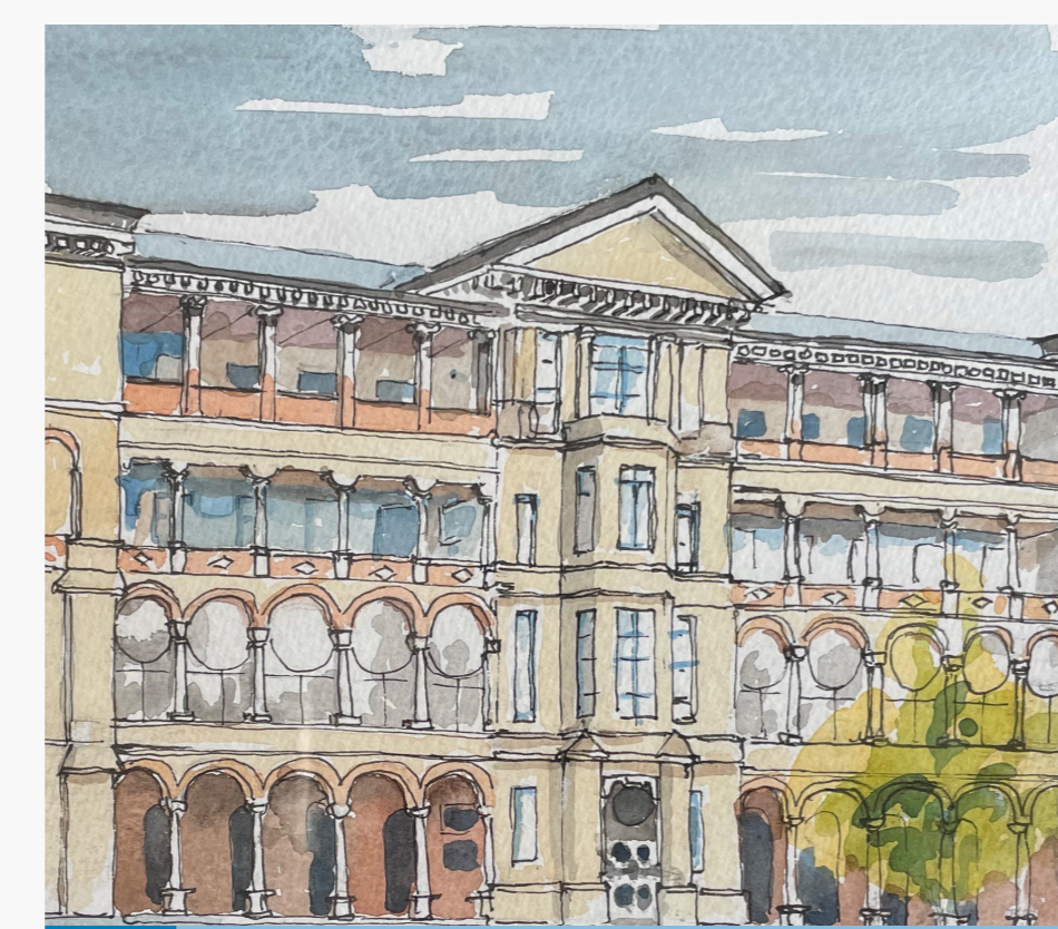
9 Old Addenbrookes