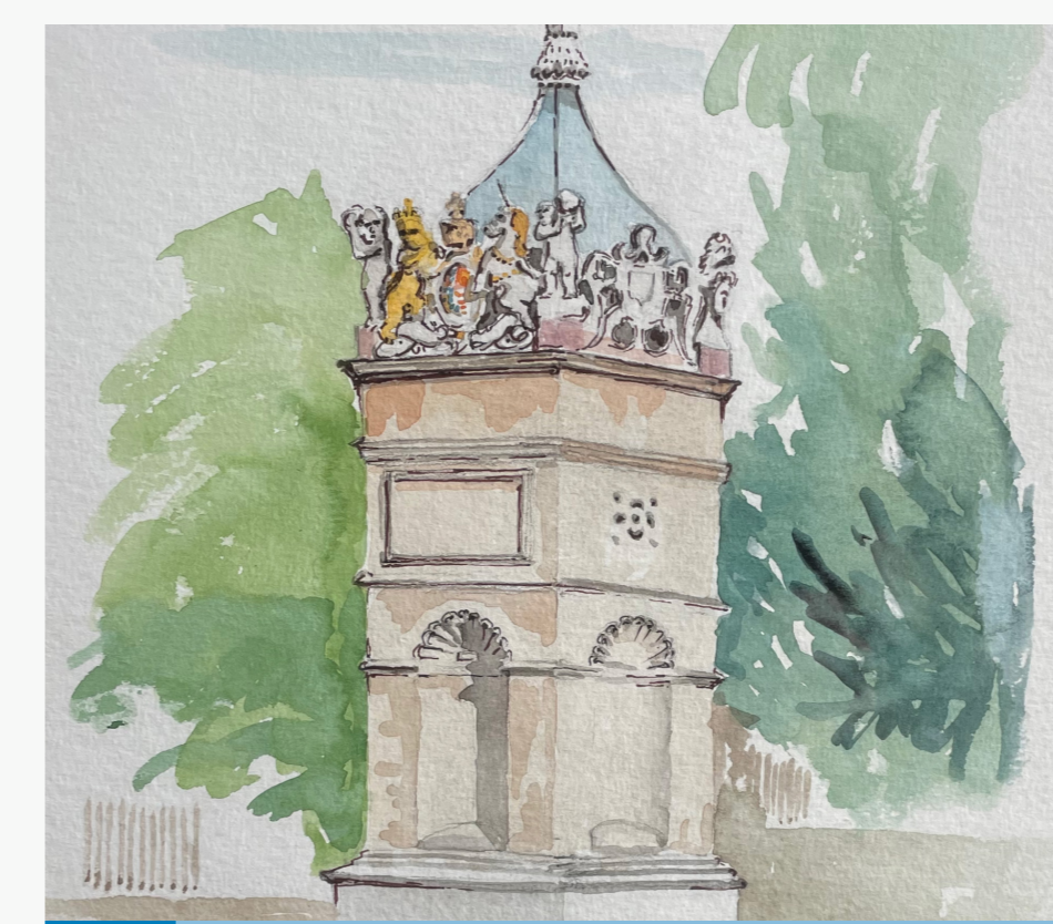
11 Hobson's Conduit