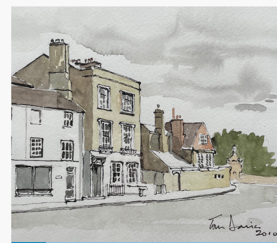
10 Trumpington Street