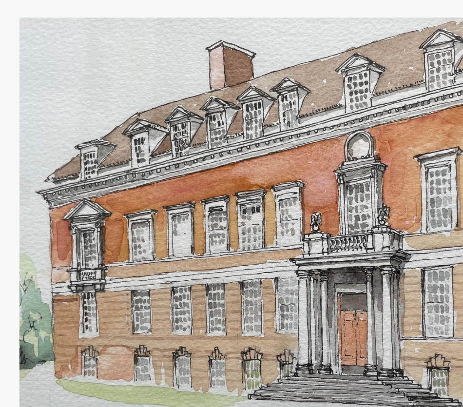
14 Biochemistry Department