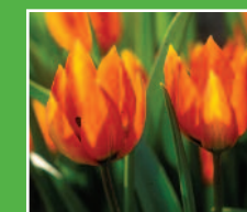
Species tulips are one of nine national collections at the Garden.