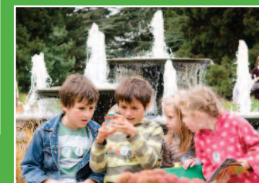
The Garden is a natural classroom