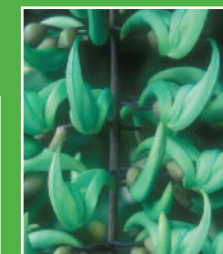
The rare Jade vine is one of the Garden's spring stars.

In the Glasshouse Range, you can discover the plants of mountains, tropical rainforests and arid lands.