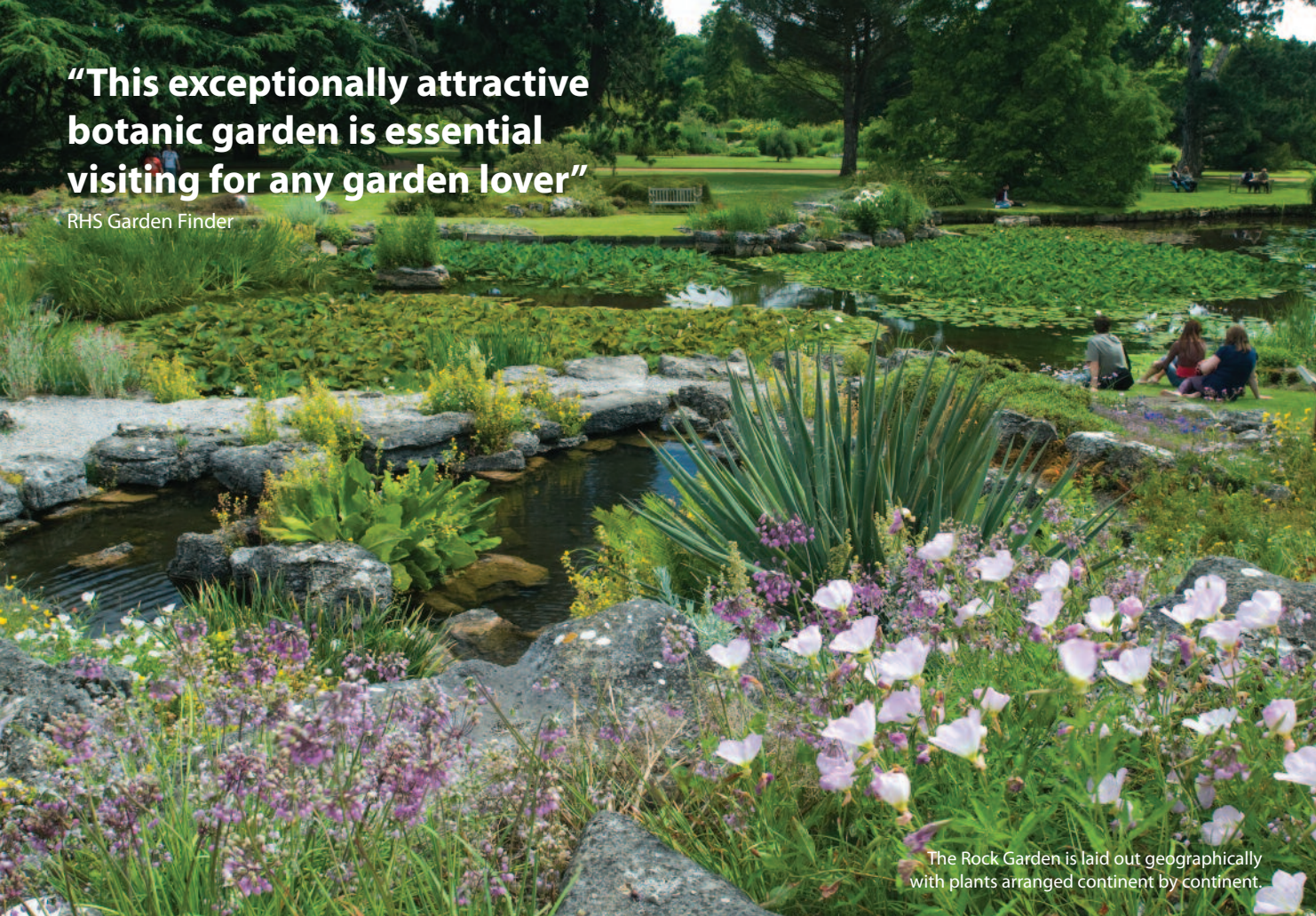
The Rock Garden is laid out geographically with plants arranged continent by continent.

This heritage-listed Garden opened in 1846 thanks to the vision and drive of Professor John Henslow, mentor to Charles Darwin. Today the Garden is a showcase for over 8000 plant species from around the world, including nine national collections, all immaculately displayed amongst the finest arboretum in the region.