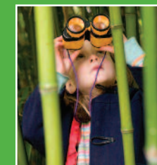
Young Explorer backpacks contain everything a budding naturalist might need!