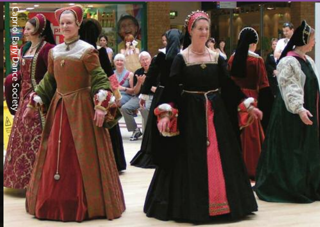
Capitol Early Dance Society

The main day of the Festival is bursting with free events for the whole family to enjoy. Here are some highlights: