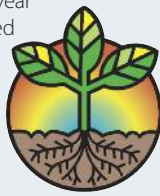
Village Outreach Society

Performance, Arrive on time, All ages, Pre book (tel: 0845 196 2776 or email: festivalbookings@anglia.ac.uk, £3 entry) Presented by Anglia Ruskin University